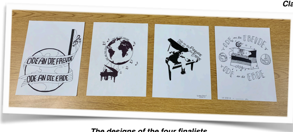
The designs of the four finalists.