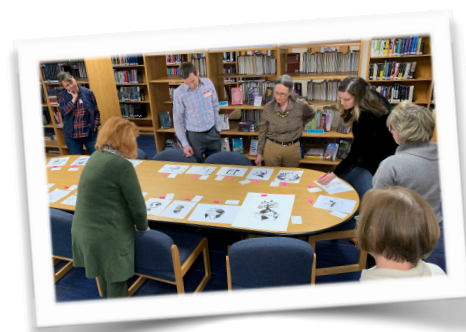
Meeting attendees ponder a difficult choice.

• Following lunch, teachers selected the winning design for the official German Day competition T-shirt.